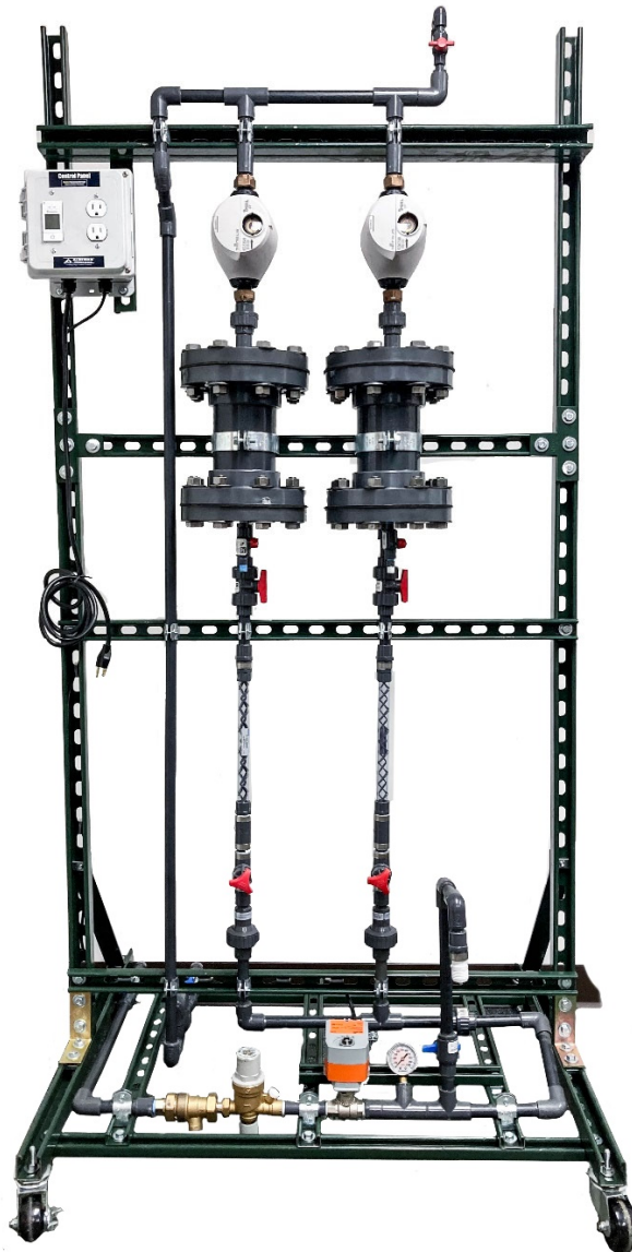
Photo above is a 2-chamber PRS Monitoring Station. A PRS Monitoring Station with 4 test chambers is also available.